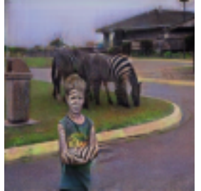
P_{0.5}(w) \rightarrow Q_{12}(w, f)