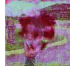
P_{0.5}(w) \rightarrow Q_8(w, f)